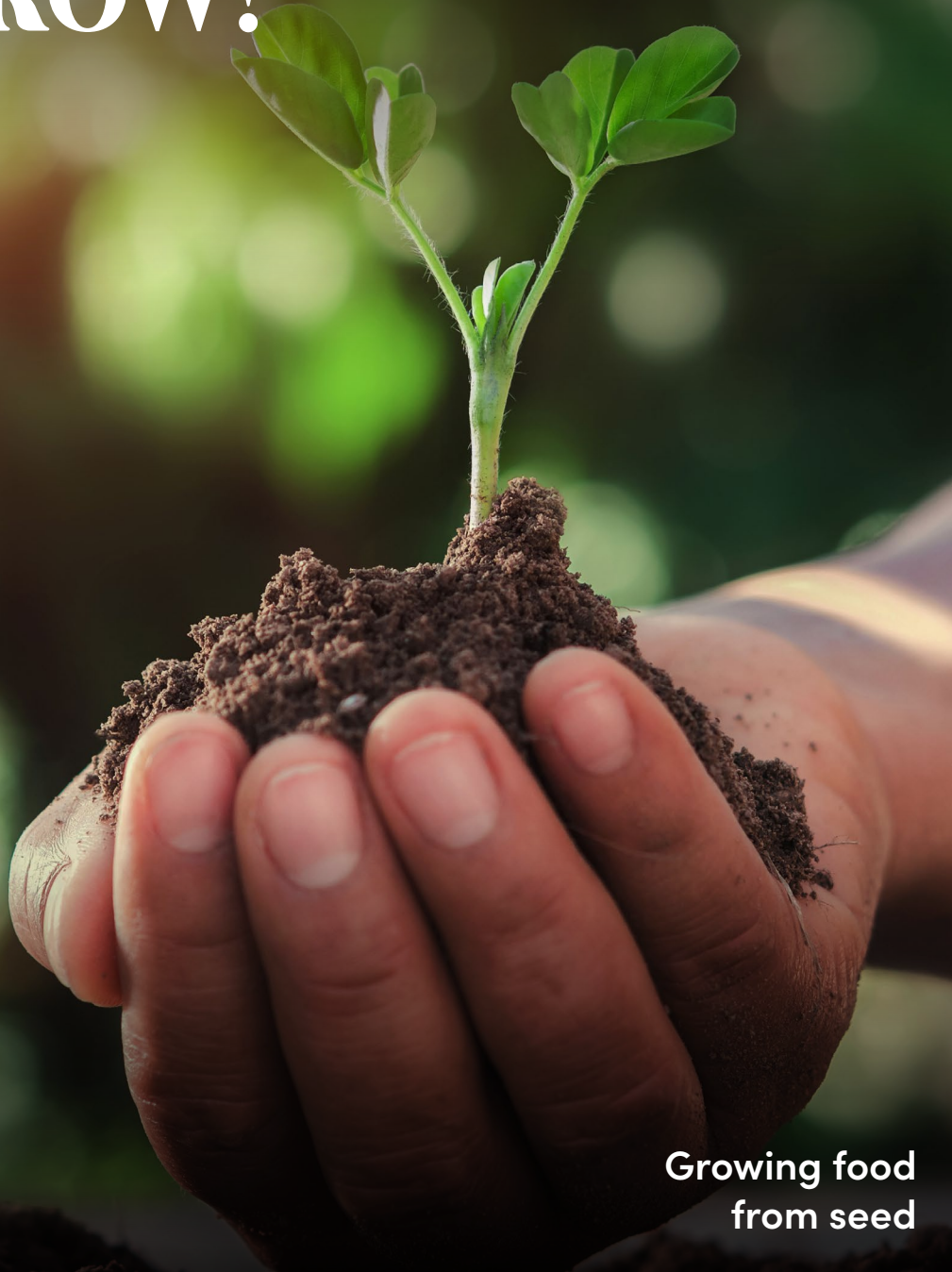
Growing food from seed

Dietitian's Corner Kickstart Your Day: Breakfast Matters